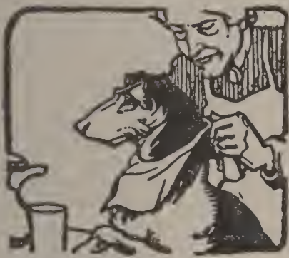
Refused to Eat With- out a Napkin.

D ADDY had heard of a dog who had perfect table manners.